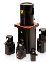
900-Series Pneumatic Pinch Valves