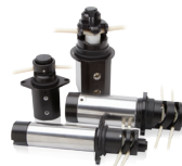
600-Series Pneumatic Pinch Valves